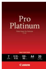
Photo Paper Pro Platinum PT-101

The ultra glossy photo paper. Make your prints come alive in vibrant, vivid colors, offers a paper thickness unrivaled among commercial photo papers, and exceptional print quality for truly unforgettable photos.