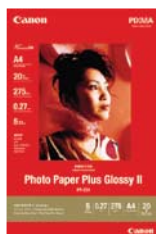
Photo Paper Plus Glossy II PP-201

Photo Paper Plus Glossy II yields a glossy finish and exceptionally rich colors, giving your images the look and feel of traditional photographs.