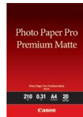
Photo Paper Pro Platinum Premium Matte PM-101

Superb for warm color reproduction, perfect tonal gradations in mono printing, smooth, non-glare matte surface, excellent match for PIXMA Pro Printers.